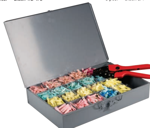
706 PC Heat Shrink Kit w/ Ratchet Tool Part # 5990-706 18.5" x 12"