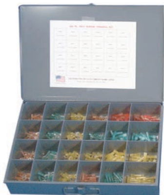
18 x 12"