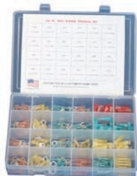
9 x 13"