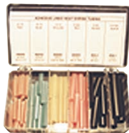
68 PC Heat Shrink Tubing Kit Part # 5990-68 8 x 4.5"