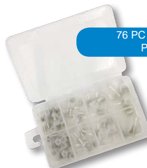
76 PC Closed End Connector Kit Part Number: 5990-76