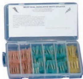
140 PC Heat Shrink Butt Connector Kit Part # 5990-140 8 x 4.5"