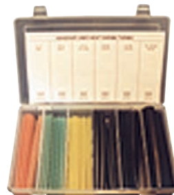
38 PC Heat Shrink Tubing Kit Part # 5990-38 11 x 6.5"