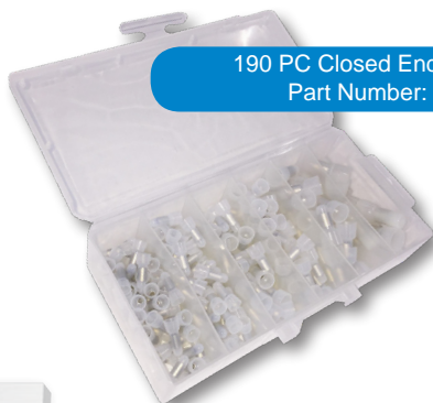
190 PC Closed End Connector Kit Part Number: 5990-190