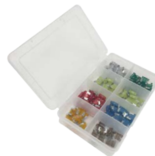
130 PC Micro Fuse Low Profile Kit Part # 5990-130

2 pcs. - 30, 70, 80 & 100 amp 4 pcs. - 40, 50 & 60 amp