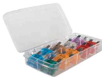
20 PC Maxi Fuse Kit Part # 5990-20 7 x 3.5"

10 pcs. - 25 amp 5 pcs. - 3, 4, 5, 7.5, 10, 15, 20, 30, 35 and 40 amp