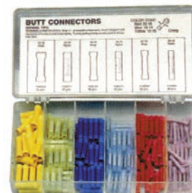
170 PC Butt Connector Kit Part # 5990-170 7 x 3.5"

100 pcs. - 22-18 Rings, Stud Size #8, 10, 1/4, 5/16 100 pcs. - 16-14 Rings #10, 1/4, 5/16, 3/8 100 pcs. - 12-10 Rings #10, 1/4, 5/16, 3/8 100 pcs. - 22-18, 16-14, 12-10 Butt 100 pcs. - 22-18, 16-14, 12-10 Spade #10 100 pcs. - 22-18, 16-14, 12-10 Male 1/4 100 pcs. - 22-18, 16-14, 12-10 Female 1/4