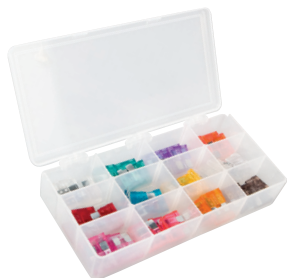
60 PC Standard Fuse Kit Part # 5990-60 7 x 3.5"

20 pcs. - 10 amp 10pcs. - 3, 4, 5, 7.5, 15, 20, 25 & 30 amp