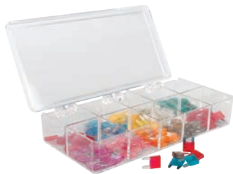
100 PC Mini Fuse Kit Part # 5990-100 7 x 3.5"

20 pcs. - 10 amp 10pcs. - 3, 4, 5, 7.5, 15, 20, 25 & 30 amp