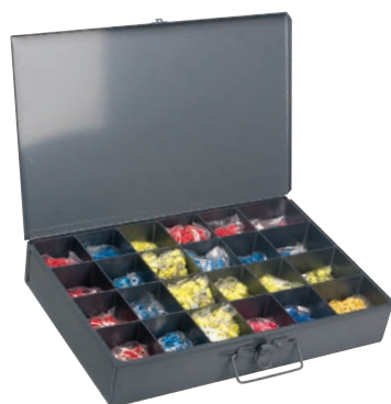
2400 PC Starter Kit Part # 5990-2400N = Nylon Part # 5990-2400V = Vinyl Metal Box 18.5 x 12"

1 pc. - Economy Crimper 20 pcs. - 12-10 Butt Splice 20 pcs. - 16-14 Butt Splice 20 pcs. - 22-18 Butt Splice 10 pcs. - 12-10 Rings #8, #10, 5/16 & 3/8 10 pcs. - 12-10 Spades #6 & #10 10 pcs. - 16-14 Rings #6 & #10 10 pcs. - 16-14 Spades #6 & #10 10 pcs. - 16-14 .250 QDC Male & Female 10 pcs. - 22-18 Rings #6 & #10 10 pcs. - 22-18 Spades #6 & #10 10 pcs. - 22-18 .250 QDC Male & Female