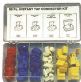
55 PC Instant Tap Connector Kit Part # 5990-55 8 x 4.5"

10 pcs. - 5 & 7.5 amp 20 pcs. - 10, 15, 25 & 30 amp 30 pcs. - 20 amp