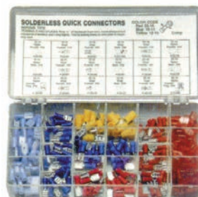
180 PC Solderless Quick Connector Kit Part # 5990-180 11 x 6.5"

40 pcs. - 22-16 Grey 30 pcs. - 22-14 Blue 20 pcs. - 22-14 Orange 15 pcs. - 18-12 Yellow 10 pcs. - 18-10 Red 5 pcs. - 14-8 Grey