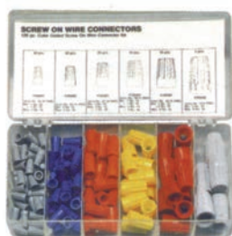
120 PC Screw On Connector Kit Part # 5990-120 8 x 4.5"

10 pcs. - 22-18 Red 25 pcs. - 18-14 Blue 10 pcs. - 18-14 White 10 pcs. - 12-10 Yellow