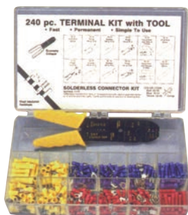
240 PC Terminal Kit with Tool Part # 5990-240N = Nylon Part # 5990-240V = Vinyl 11 x 6.5"

4 pcs. - 12-10 Butt Splice 11 pcs. - 16-14 Butt Splice 11 pcs. - 22-18 Butt Splice 4 pcs. - 12-10 Rings #10 & 3/8 11 pcs. - 16-14 Rings #6, #8 & #10 9 pcs. - 16-14 Ring 1/4 11 pcs. - 16-14 Spades #6, #8 & #10 11 pcs. - 16-14 .250 QDC Male & Female 11 pcs. - 22-18 Ring #10 11 pcs. - 22-18 Spades #6 & #10 11 pcs. - 22-18 .250 QDC Female