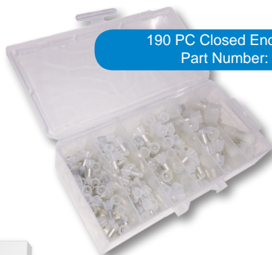
190 PC Closed End Connector Kit Part Number: 5990-190