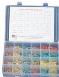
9 x 13"