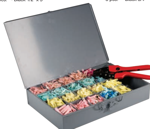
706 PC Heat Shrink Kit w/ Ratchet Tool Part # 5990-706 18.5" x 12"