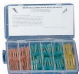
140 PC Heat Shrink Butt Connector Kit Part # 5990-140 8 x 4.5"