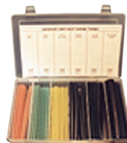
38 PC Heat Shrink Tubing Kit Part # 5990-38 11 x 6.5"