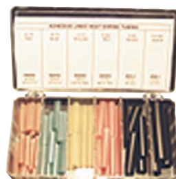
68 PC Heat Shrink Tubing Kit Part # 5990-68 8 x 4.5"